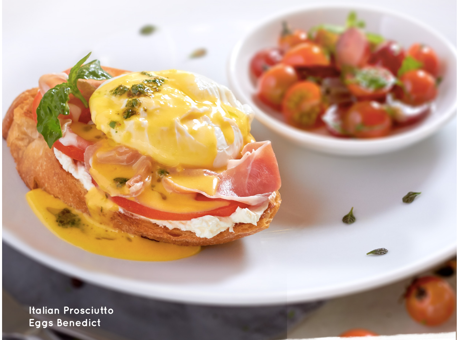
Italian Prosciutto Eggs Benedict

PRICES ARE VAT INCLUSIVE. NO SERVICE CHARGE.